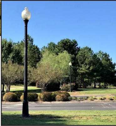
The intersection of Village Green Parkway, Silver Bluff and Richardson Lake Road

After many months of waiting, the Silver Bluff road widening project is completed and has turned out well. Our entrance is much safer and the lighting that had been removed during construction has been replaced. Thanks to those public officials who made this happen!