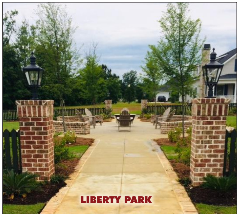
Go check out the latest addition to the neighborhood — Liberty Park, located directly behind the Courtyard Townhomes on Barrister Lane.

In our previous newsletter we reported that there were residents requesting that the park be used as a dog park for the neighborhood — a "Bark Park". However, our newest park will remain as is — a general use park. The topic was discussed at our Homeowners Association Board meeting and a synopsis of that discussion is that people who have dogs and live away from the park.....are OK with the "Bark Park" idea. On the other hand, those who live close by are uniformly against the concept....including dog owners. Because of this lack of consensus, there will be no dog park.