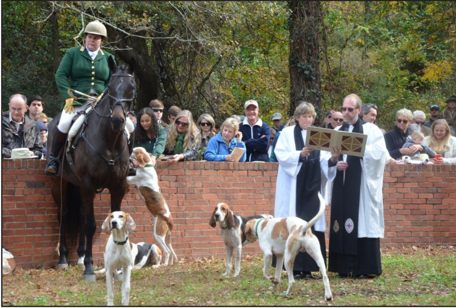
The Blessing of the Hounds at Memorial Gate in Hitchcock Woods

Aiken celebrates Thanksgiving as a community with three events that have become traditions. Held in and around the downtown area, Bloodies and Bagels, Blessing of the Hounds and One Table are open to the public and FREE to attend.