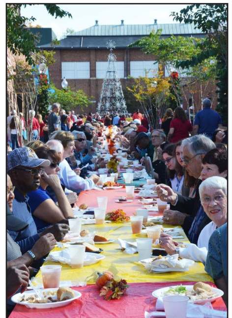
One Table provides a Thanksgiving meal uniting the Aiken community.