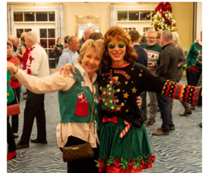
Ugly Sweater Pub Club