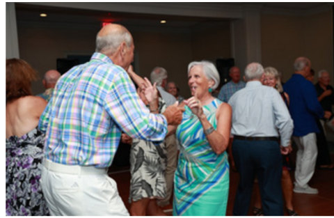
Adult Egg Hunt Pub Club